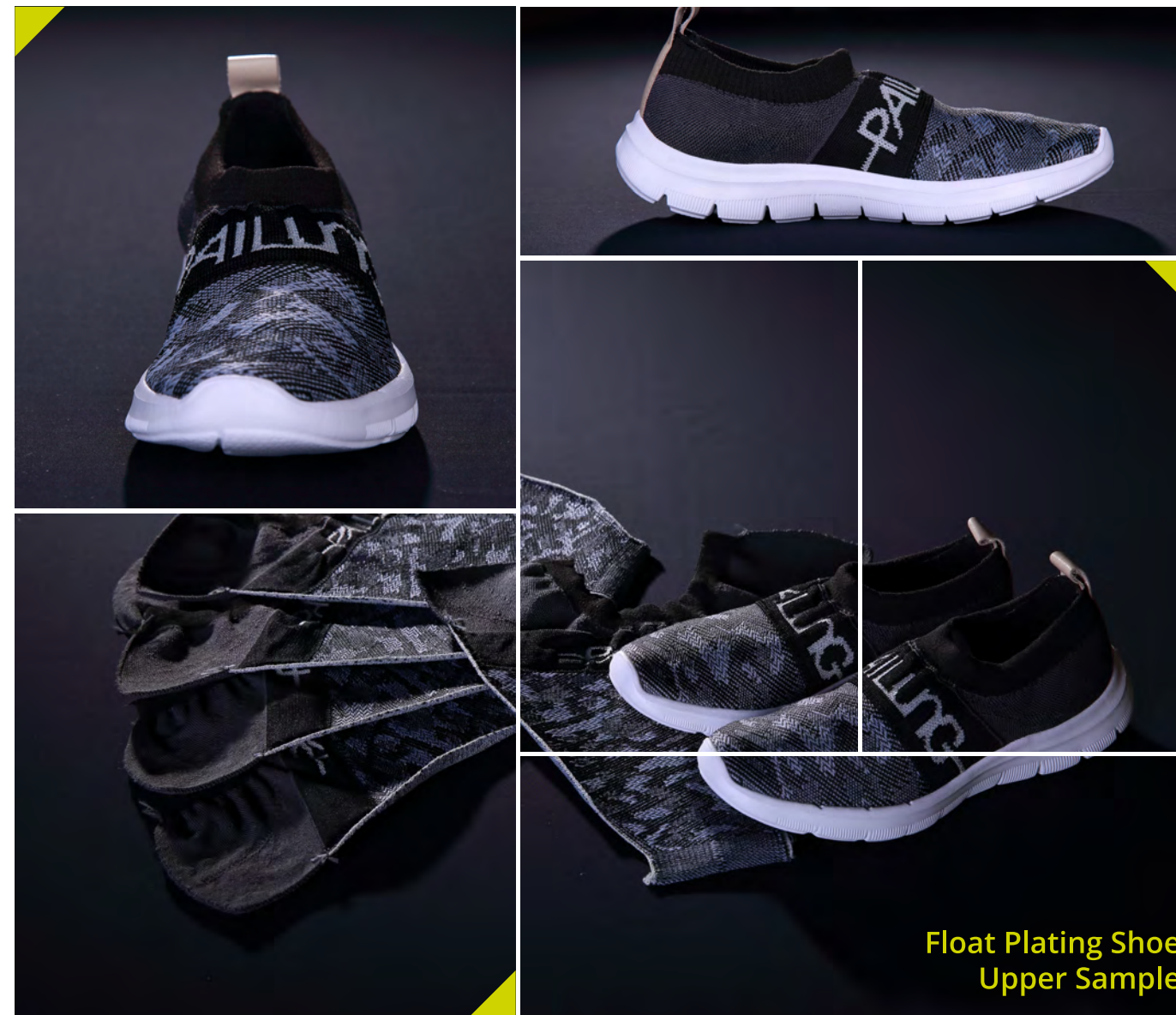
Float Plating Shoe Upper Sample

● This information would be affected by yarn and other conditions, please refer to the actual situation. ● 此產能數據會受到紗線規格和織造組織等因素影響，此為參考數據，請以實際為準 100% Polyester 600D(40 D Spandex)